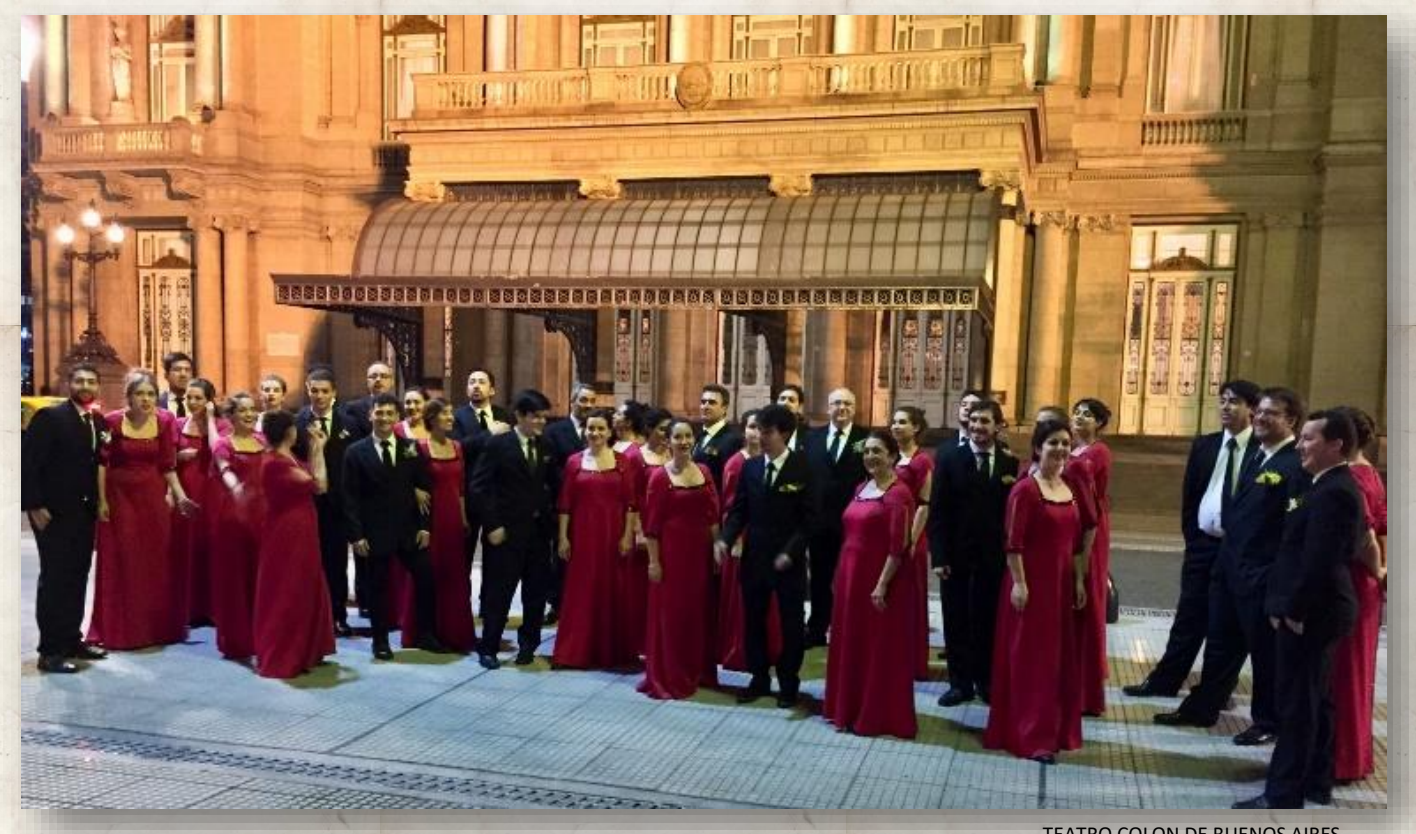
TEATRO COLON DE BUENOS AIRES