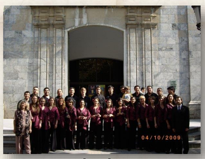
MALGRAT DE MAR – CATALUÑA - ESPAÑA

In its 36 years of experience, the CCM has been presented in the most important cities of Argentina. In Latin America, the CCM has given concerts in Chile (1994 – 2016), Brasil (1996 -2011- 2015) and Uruguay (1989). It is worth noting the european tours, where it visits several cities of Italy, France, Spain (2009) and Poland, Czech Republic, Slovenia (2018).