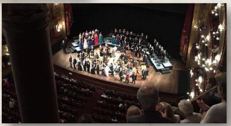
TEATRO COLON DE BUENOS AIRES