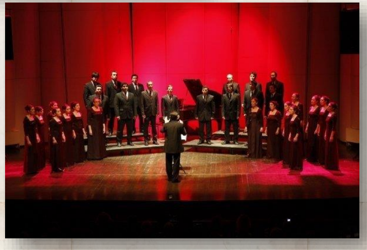
TEATRO INDEPENDENCIA – MENDOZA - ARGENTINA