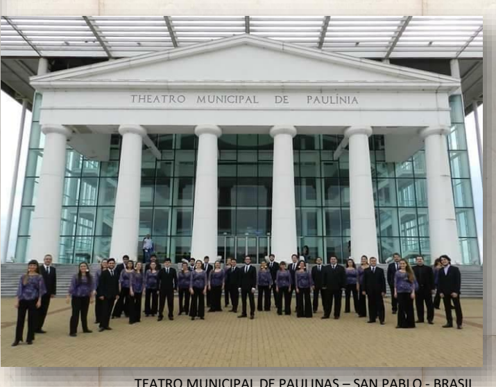
TEATRO MUNICIPAL DE PAULINAS - SAN PABLO - BRASIL