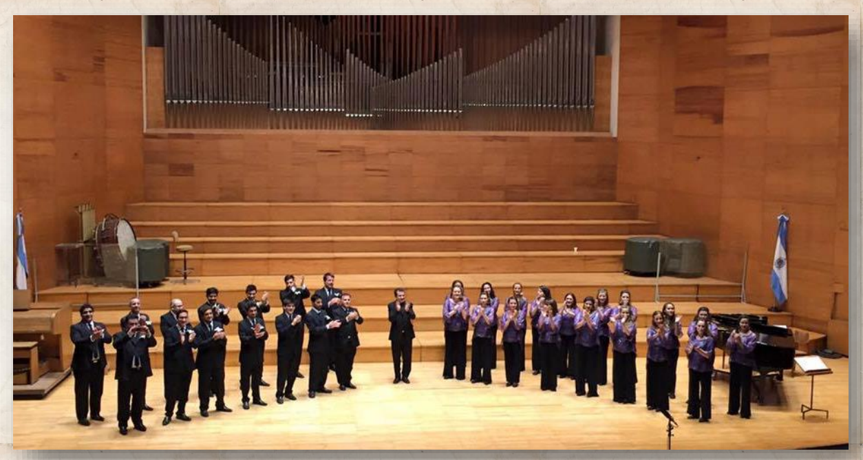
AUDITORIO VICTORIA – SAN JUAN – ARGENTINA

In 2011, he was appointed Director of the World Youth Choir by IFCM (International Federation for Choral Music), Europe Cantat and Musical Youths of Europe.